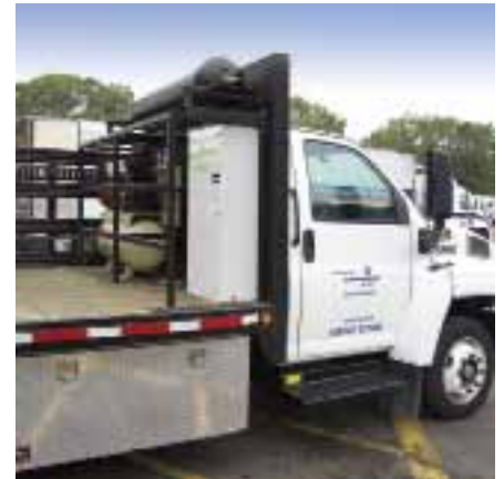
MTS06 Installed on a Service Truck

Bulletin TSTRCKFLT Printed in U.S.A. August 2007 Copyright© Parker Hannifin Corporation 2007